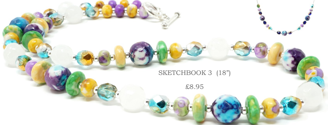
SKETCHBOOK 3 (18")