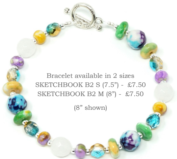
Bracelet available in 2 sizes SKETCHBOOK B2 S (7.5") - £7.50 SKETCHBOOK B2 M (8") - £7.50