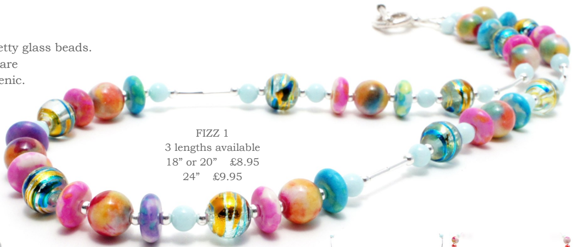
FIZZ 1 3 lengths available 18" or 20" £8.95 24" £9.95

Handmade in Wales Colourful dyed Jade & pretty glass beads. All clasps, ear studs etc. are silver plated & hypoallergenic. All come in a gift box.