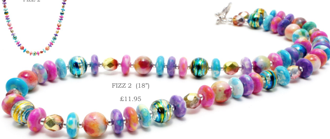
FIZZ 2 (18") £11.95