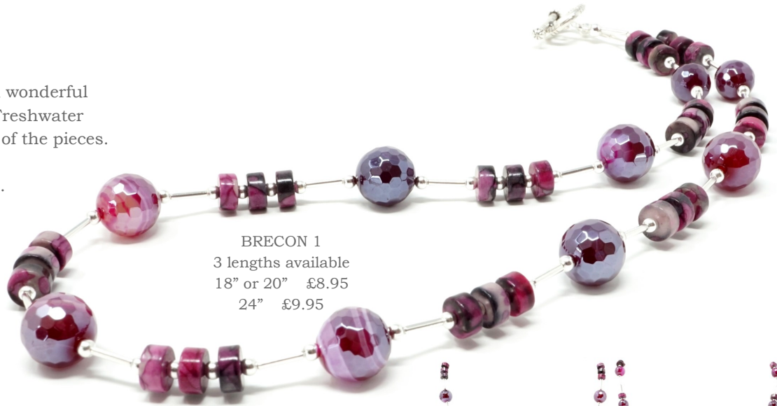
BRECON 1 3 lengths available 18" or 20" £8.95 24" £9.95