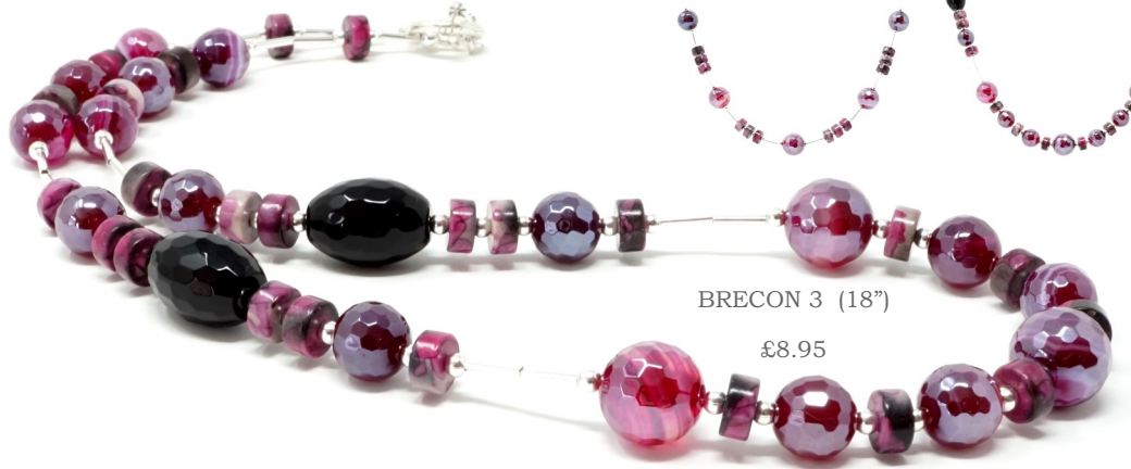
BRECON 3 (18")