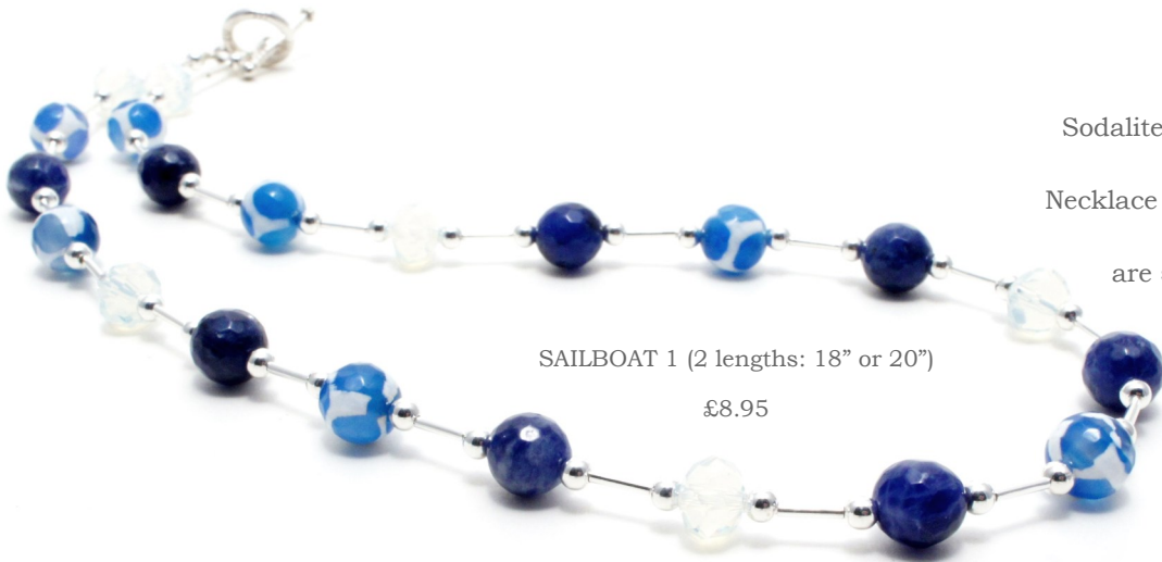
SAILBOAT 1 (2 lengths: 18" or 20")