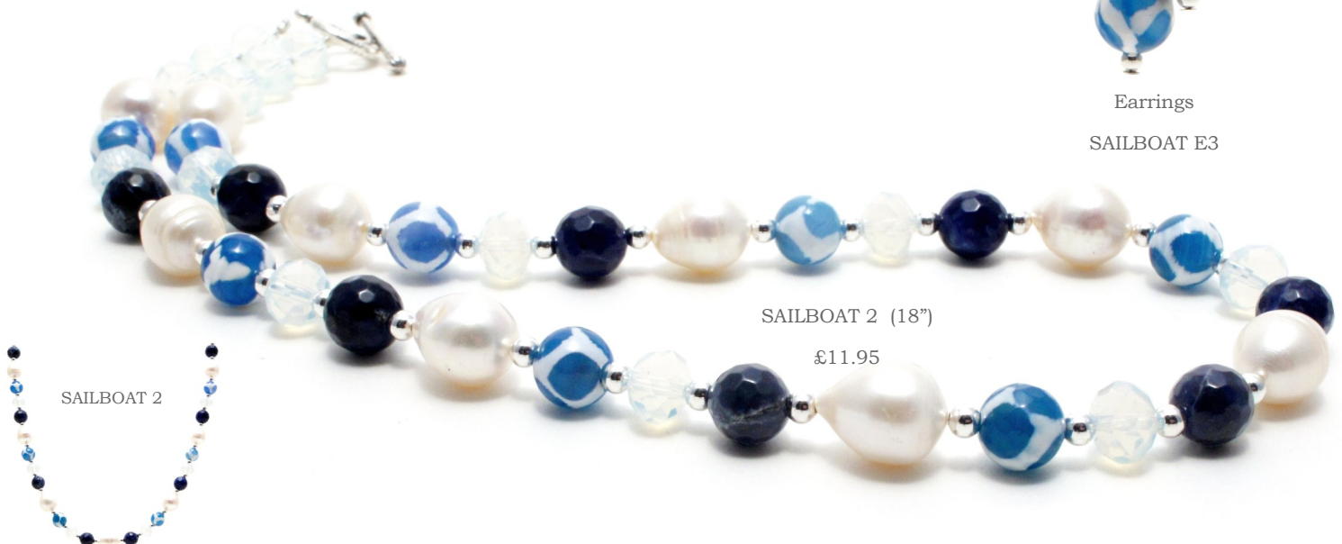
SAILBOAT 2 (18")