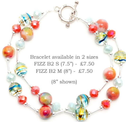
Bracelet available in 2 sizes FIZZ B2 S (7.5") - £7.50 FIZZ B2 M (8") - £7.50 (8" shown)