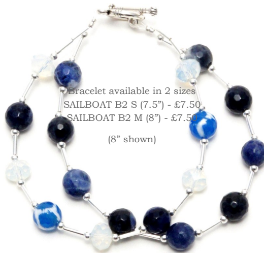
Bracelet available in 2 sizes SAILBOAT B2 S (7.5") - £7.50 SAILBOAT B2 M (8") - £7.50