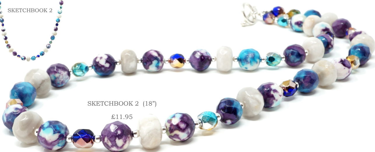
SKETCHBOOK 2 (18")