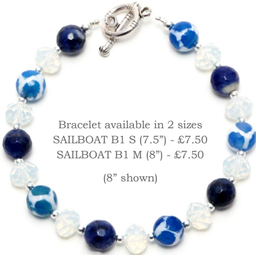
Bracelet available in 2 sizes SAILBOAT B1 S (7.5") - £7.50 SAILBOAT B1 M (8") - £7.50