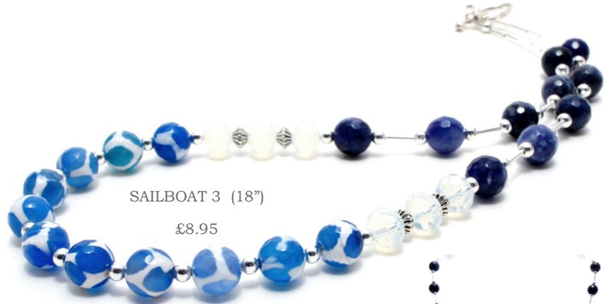
SAILBOAT 3 (18")