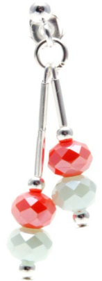
Earrings FIZZ E3