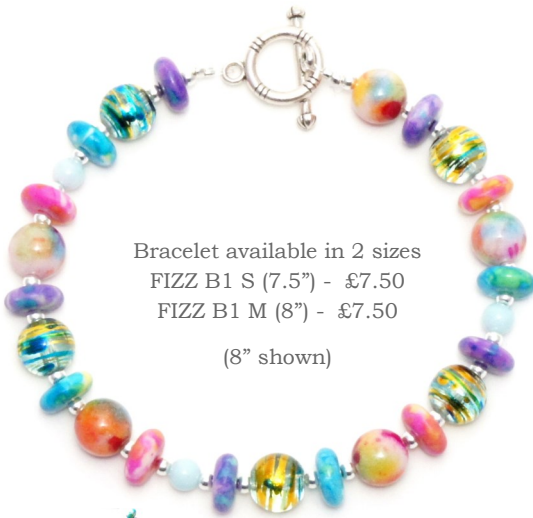
Bracelet available in 2 sizes FIZZ B1 S (7.5") - £7.50 FIZZ B1 M (8") - £7.50 (8" shown)