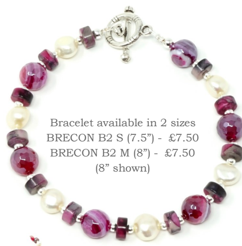
Bracelet available in 2 sizes BRECON B2 S (7.5") - £7.50 BRECON B2 M (8") - £7.50 (8" shown)