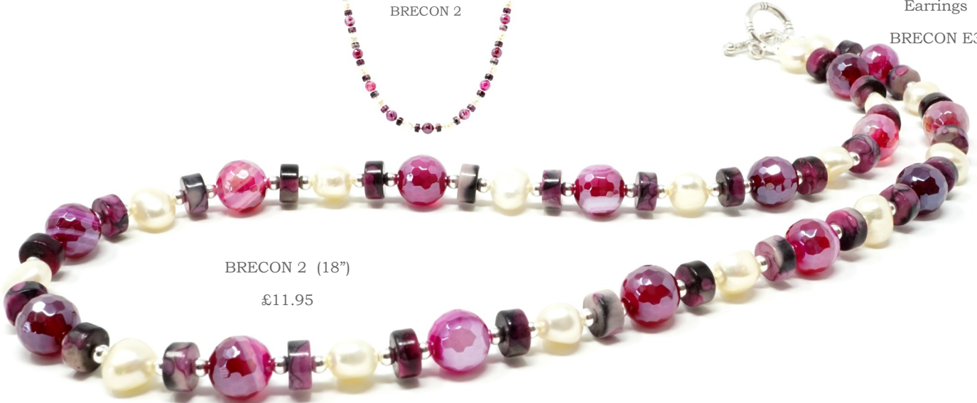
BRECON 2 (18")