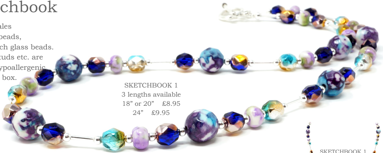
SKETCHBOOK 1 3 lengths available 18" or 20" £8.95 24" £9.95

Handmade in Wales Agate gemstone beads, dyed Jade & Czech glass beads. All clasps, ear studs etc. are silver plated & hypoallergenic. All come in a gift box.