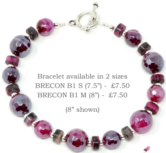
Bracelet available in 2 sizes BRECON B1 S (7.5") - £7.50 BRECON B1 M (8") - £7.50 (8" shown)