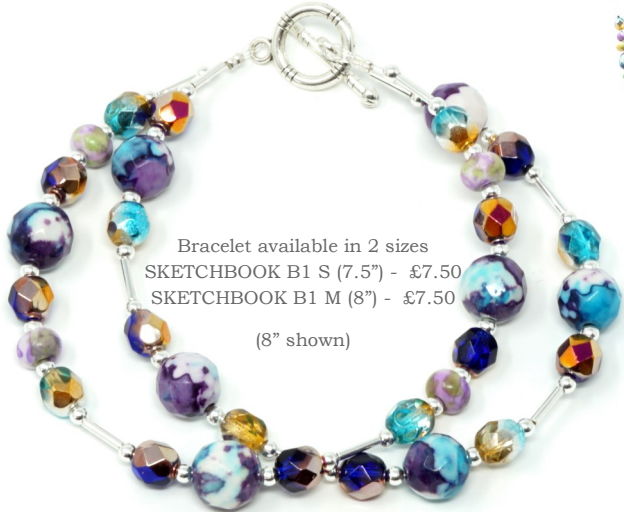
Bracelet available in 2 sizes SKETCHBOOK B1 S (7.5") - £7.50 SKETCHBOOK B1 M (8") - £7.50